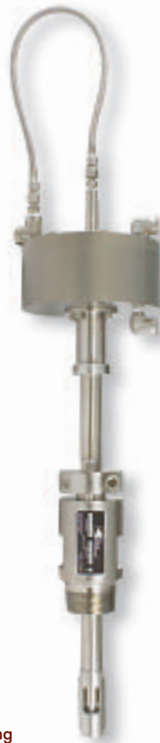
KAM® IAS™ sampler with 2" MNPT Seal Housing