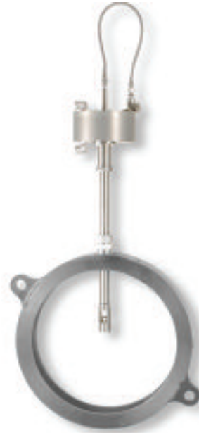
KAM® IAS™ sampler with spacer for shipboard