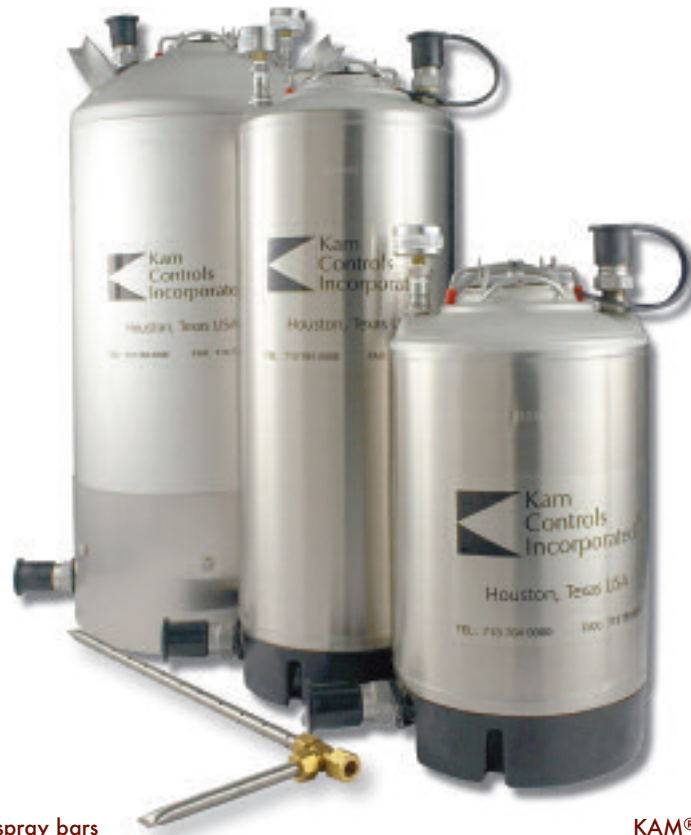
Internal spray bars