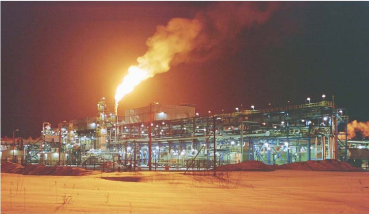
source: Luginetsky Gas Compressor Station Strezhevoy, Western Siberia, Russia

Besta has over 40 years experience successfully supplying the most reliable and safe level switches to the Oil & Gas industry. Trimod Besta float level switches carry ATEX and IECEx approvals to serve in the most difficult applications on- and offshore.