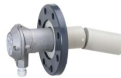
For corrosive or high purity media