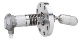
High temperature and severe environmental conditions